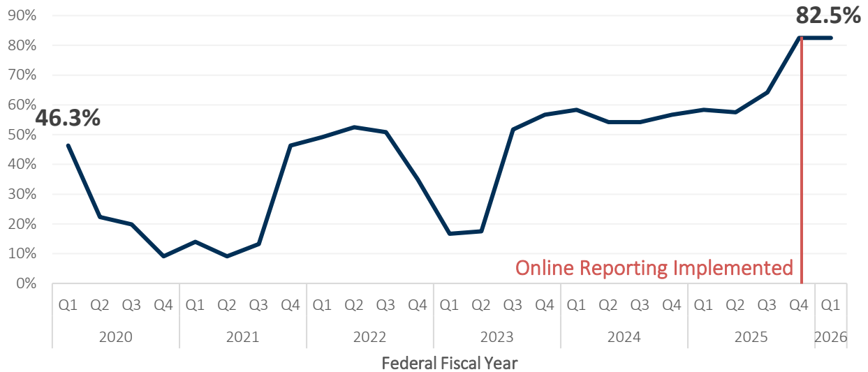
Figure 2. Idaho DCRA Participation Rates by Quarter

Overall, the average quarterly response rate has been 43%, much lower than the 95% participation noted above based on submission of at least one DCRA report over the last six years. However, participation rates have fluctuated substantially over time and have gradually improved since 2023. Figure 2 shows that total quarterly DCRA participation rates have ranged from a low of 9% (twice) to a high of 82.5% (FFY 2025 Q4 and 2026 Q1). Response rates by agency type have seen similar swings (not shown).